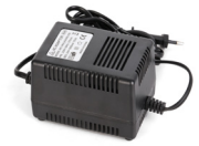
AC24V/3A Power Adapter