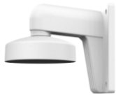
HIA-B401-110T Wall Mounting Bracket