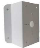
HIA-B201 Corner Mounting Bracket